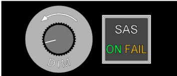
SAS Annunciator Switch Panel w/ Dimmer